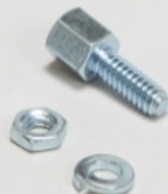
D-Sub Locking & Mounting(29)