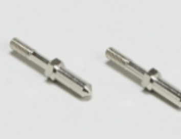
Docking Connector Guide Hardware(5)